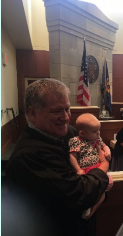
Judge Bitney: There are few greater rewards in life than seeing others succeed through the influence you've had in their lives.