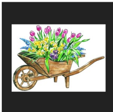
2/15/24 Preview $3 Donation 10AM-1PM