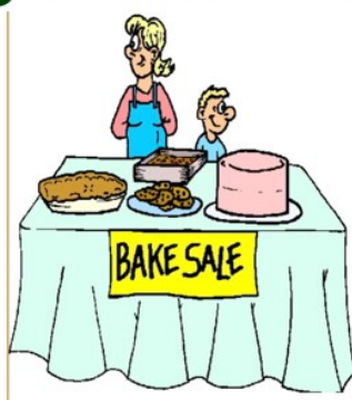
2/16/24 Free Admission 9AM-1PM