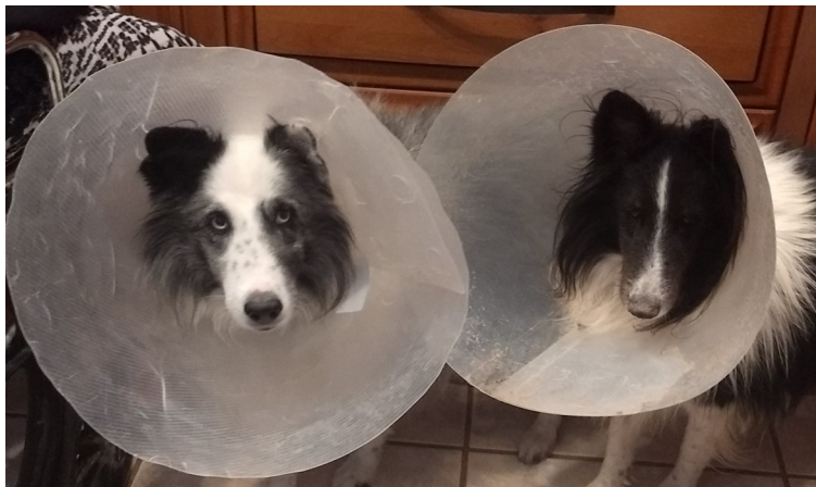
What a pair of cuties!

These sweet 8-year old Shelties were recently turned in by the owners. Blue (left) and Jess (right) were siblings., who were living outdoors on acreage. Both dogs needed to be spayed/ neutered and to receive a much-needed dental cleaning.