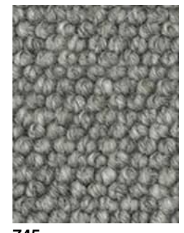
745 Evening Grey