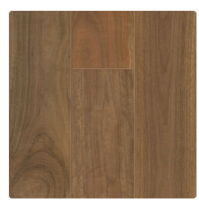
SPOTTED GUM 1511