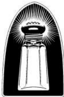
CALLED TO BE SALT

Copyright © Sermons4Kids, Inc. May be reproduced for Ministry Use