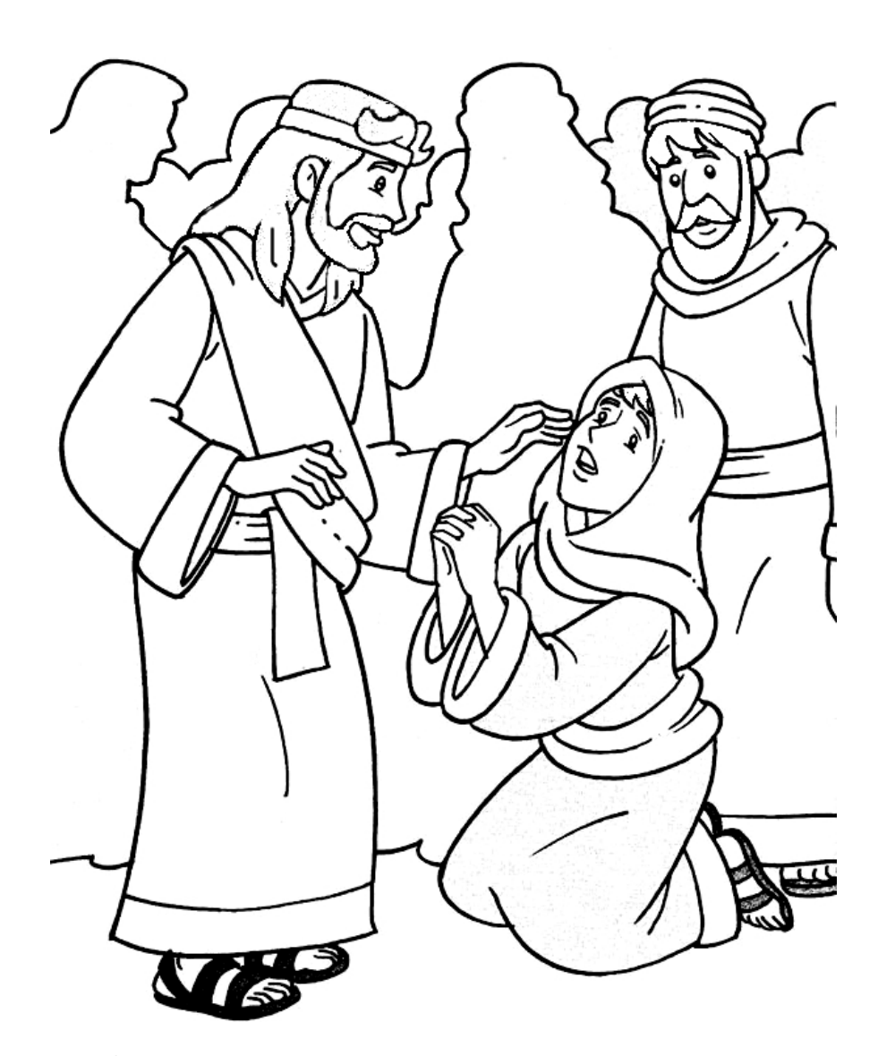
"If I just touch his clothes, I will be healed." Mark 5:28