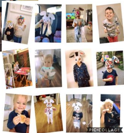
MARCH APRIL MAY 2020