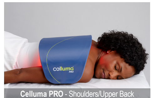
Celluma PRO - Shoulders/Upper Back