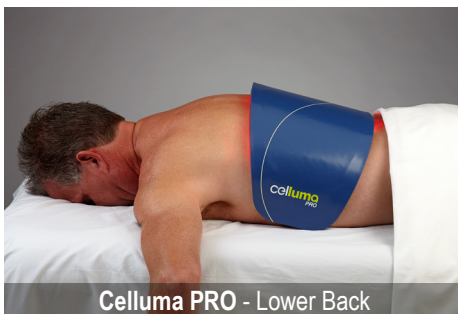
Celluma PRO - Lower Back

Any Celluma model that has a Pain Program is suitable for treating pain issues during massage sessions. Celluma's unique, flexible design also allows it to be placed in direct contact or wrapped around certain body parts including a shoulder or hip complex, leg, wrist, elbow, or knees.