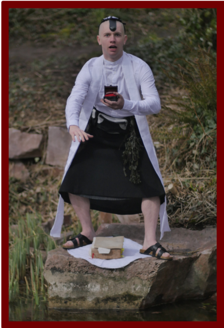
(For the Future of Us, 2018)