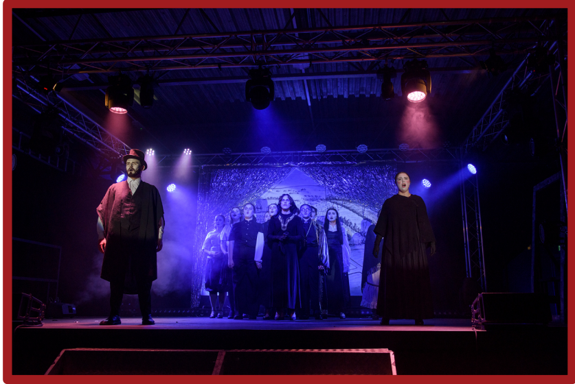
(The Mystery of Edwin Drood, 2023)