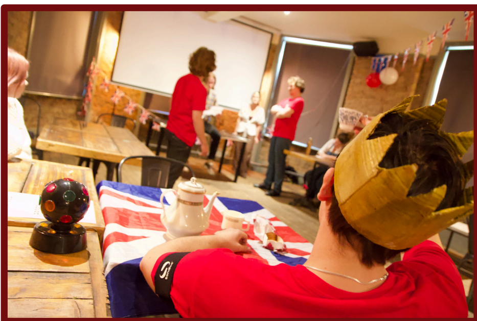
(The First King of Britain, 2022)