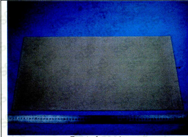
Front of sample