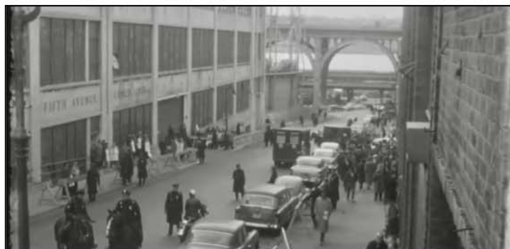
Striking TWU workers picketing on West 133rd Street in front of the Fifth Avenue Coach Lines garage in 1962. This location would soon become the site for MaBSTOA's Manhattanville Depot.

March 1st, 2022 marked the 60th year since an iconic TWU strike took place. Triggered by the firing of 29 workers - everyone walked off the job. More than 7,500 workers who operated the private bus lines in The Bronx and Manhattan hit the streets, striking in the name of the fired workers and a proposed reorganization plan that included; laying off 1,500 workers and halting pension payments. After weeks of no bus service, the strike ended after lawmakers stepped in, stripping control from the private bus lines and creating what we know now as the, Manhattan and Bronx Surface Transit Operating Authority (MaBSTOA), restoring the fired workers to payroll and cancelling the proposed job cuts.