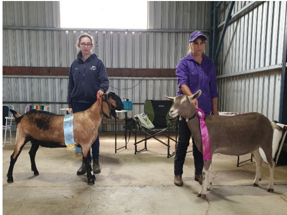
Champion Junior Doe and Reserve