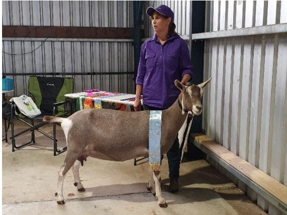
Reserve Champion Senior Doe and Best Udder