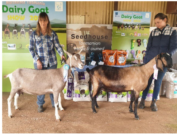
Champion Senior Doe and Reserve