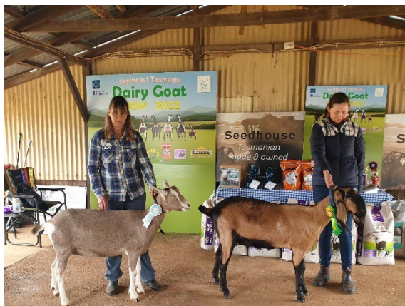
Champion Junior Doe and Reserve