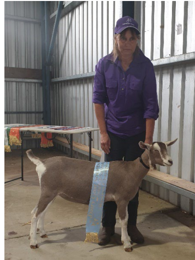
Reserve Champion Doe Kid