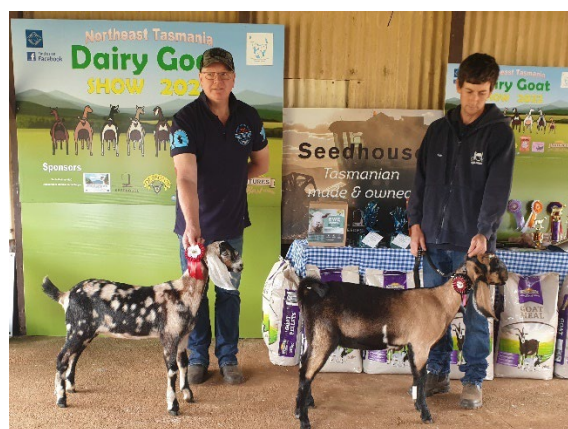
Champion Doe Kid and Reserve