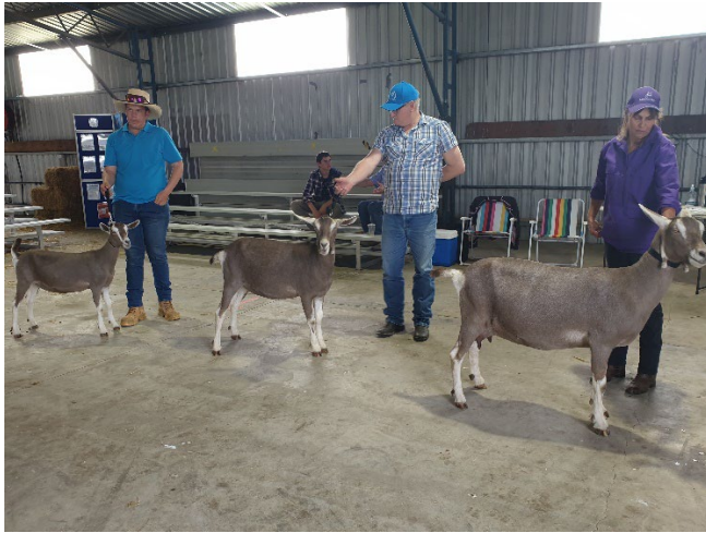
Champion Toggenburg .....