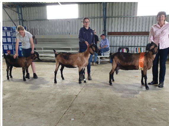
Champion Anglo Nubian