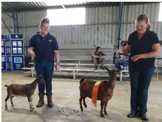
Champion Nigerian Dwarf.