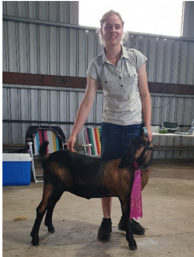
Champion Doe Kid.....