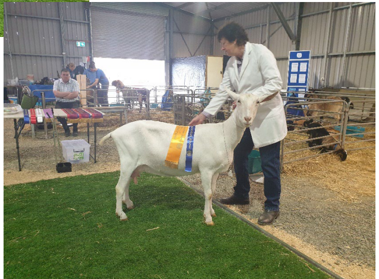
Type and Production, Highveld Melania