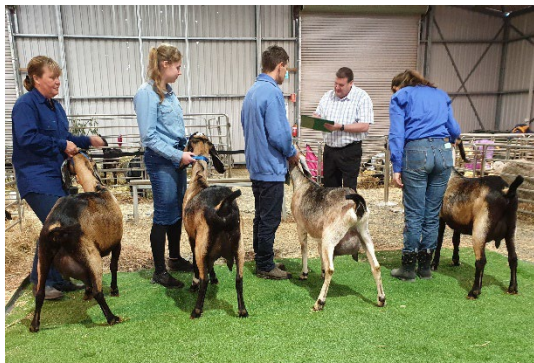
Launceston Show 2022 – Line up for Best Udder, first lactation (any breed)