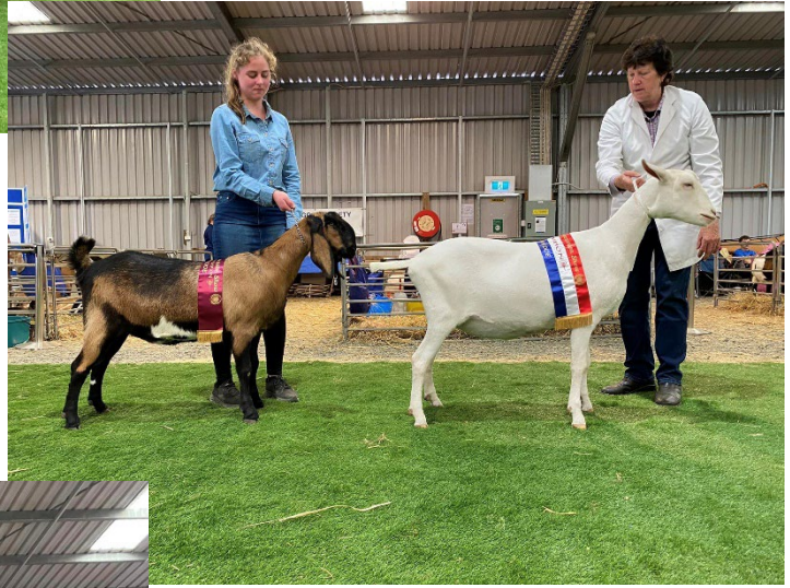
Junior Champion Doe, Highveld Melodrama and Reserve Champion Junior Doe, Peppermint Hill Aza