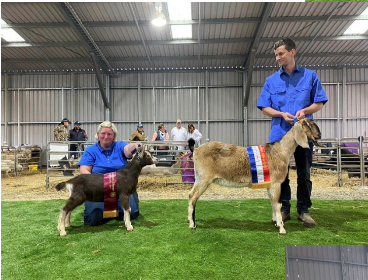
Champion Kid, Jiel Kiriah (Doe) and Reserve Champion Kid, Wheogo Swashbuckling (Buck)