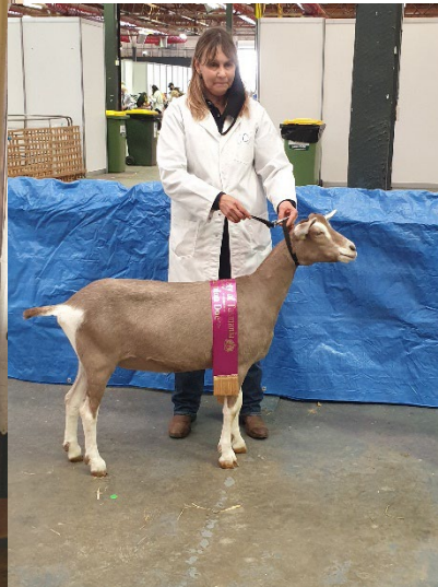
Junior Dairy Doe of the Year, Lavender Park Aria