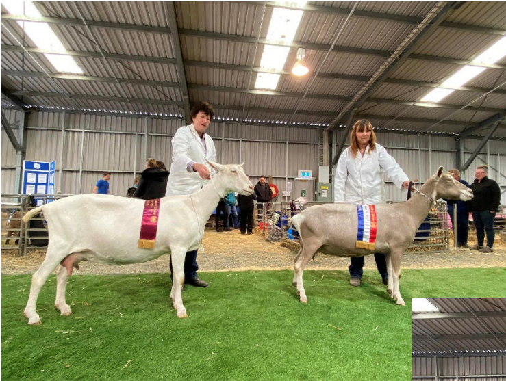
Champion Senior Doe, Heidrun Amber and Reserve Champion Senior Doe, Highveld Melania