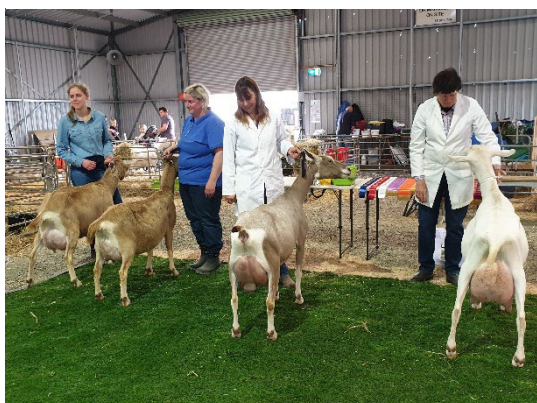
Launceston Show 2022 – Line up for Best Udder, second or subsequent lactation (any breed)