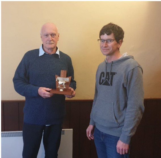
Left: Dairy Doe of the Year Award – Highveld Peony Rose Bottom Left: Dairy Doe Kid of the Year Award– Jiel Keltie Bottom Right: Junior Dairy Doe of the Year Award – Highveld Melodrama

Trophies were presented for: DDOTY – Highveld Peony-Rose JDDOTY – Highveld Melodrama DDKOTY – Jiel Keltie