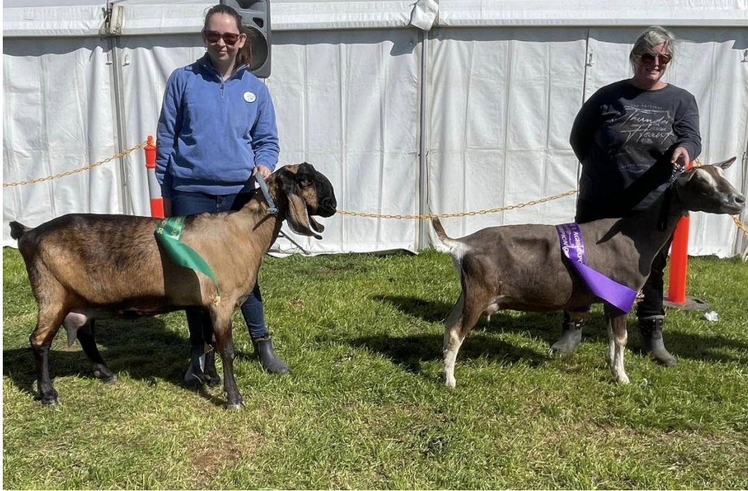
Champion Senior Doe, Best Udder Overall & Supreme Champion - Wheego Shamajazzi Reserve Champion Senior Doe and 24 hour Type & Production- Jiel Kiari