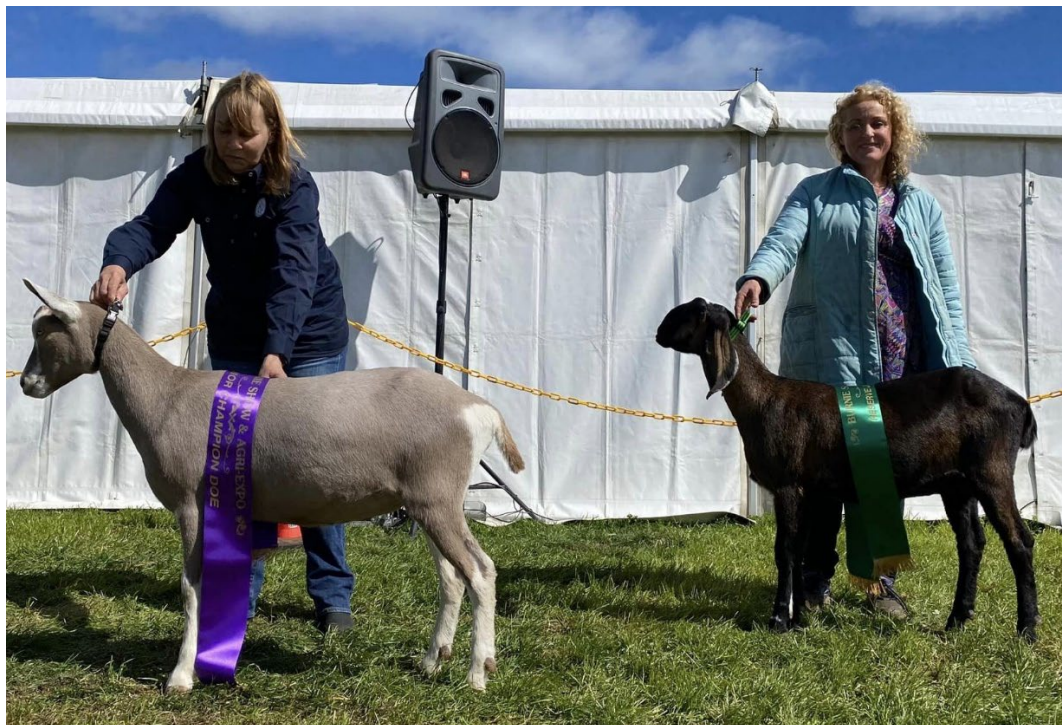
Champion Junior Doe - Lavender Park Abbey Reserve Champion Junior Doe - Dairy Dreamers Cleo