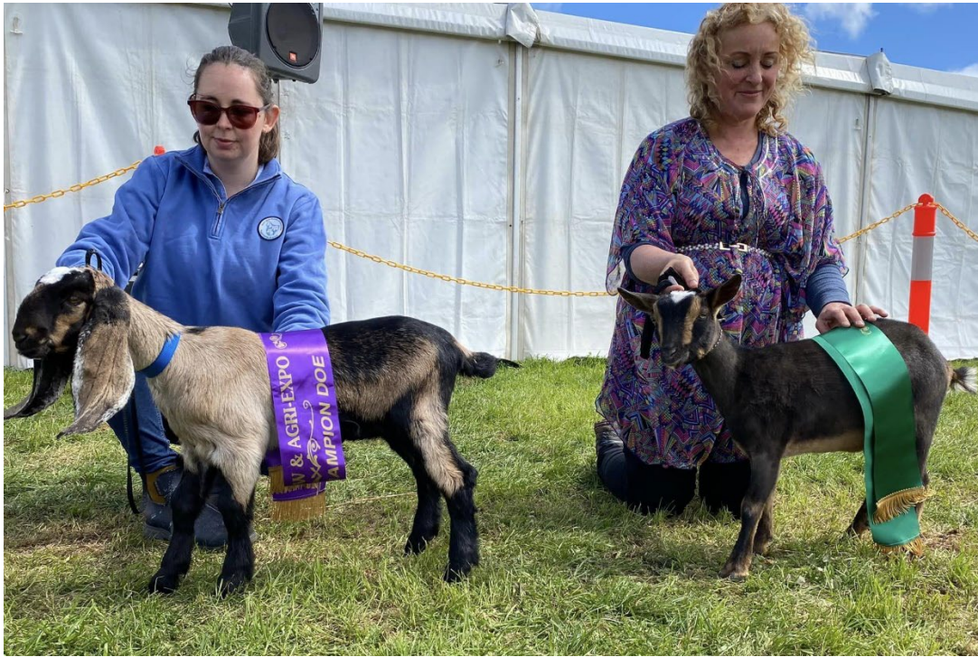
Champion Doe Kid - Jiel Kiss-of-Fate Reserve Champion Doe Kid - Dairy Dreamers Enya