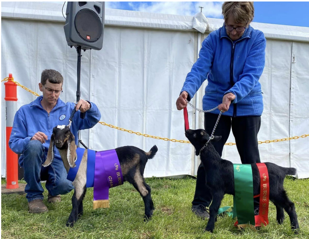
Champion Buck Kid - Jiel Providence Reserve Champion Buck Kid - Wheego Mylenni