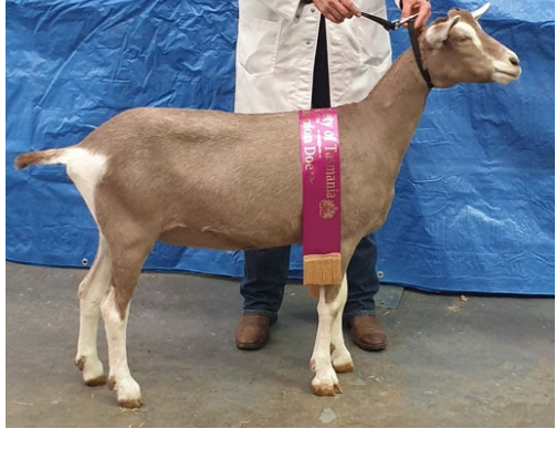
Lavender Park Aria – Reserve Junior Doe