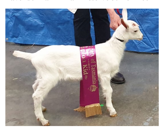
Highveld Melodrama - Reserve Doe Kid