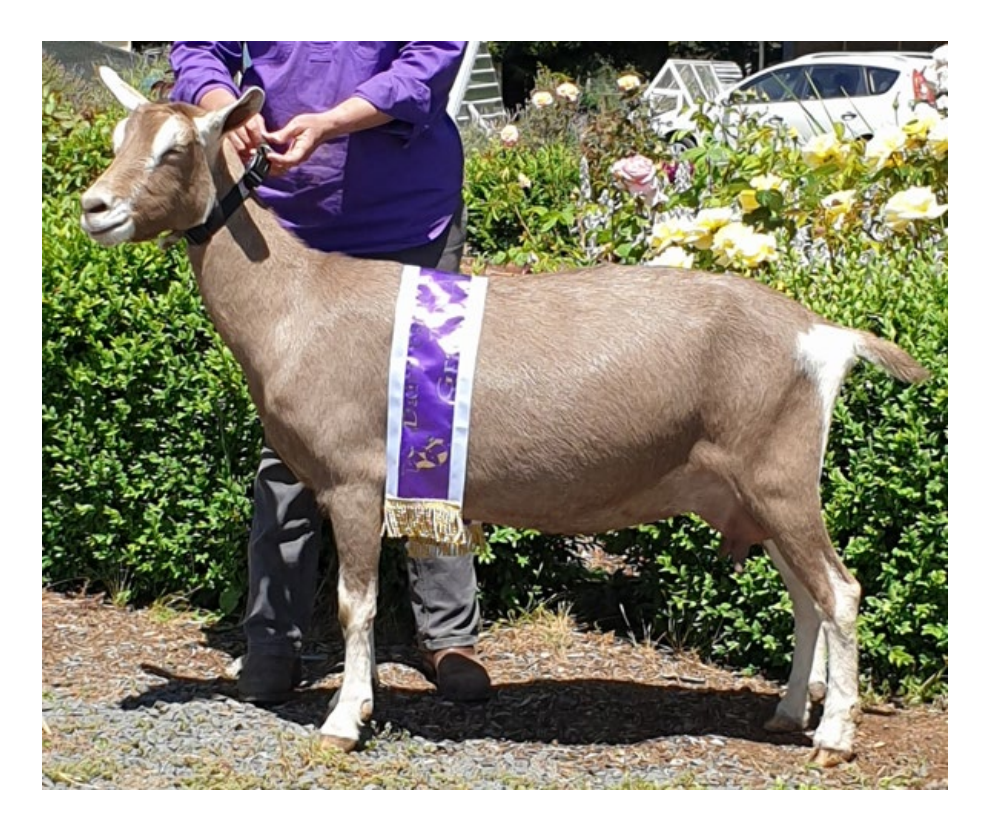
Heidrun Amber Best Exhibit, Grand Champion Doe, Champion Senior Doe, Best Udder Overall and Champion Toggenburg