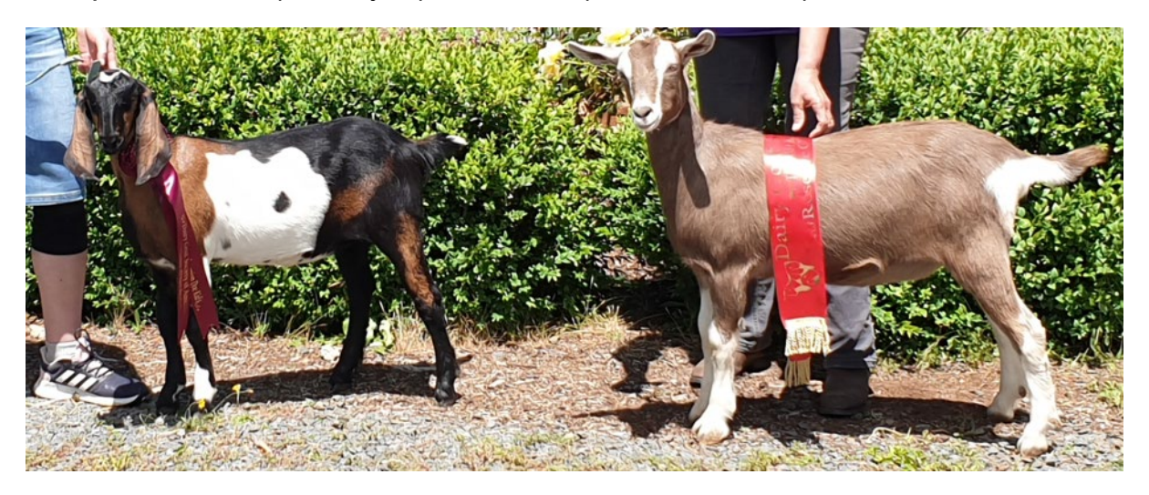
Champion Doe Kid (Killara Ram Lanika) and Reserve (Lavender Park Avia)