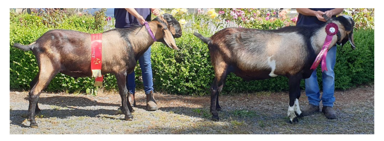
Reserve (Jiel Phoebus) and Grand Champion Buck (Jiel Perseus)