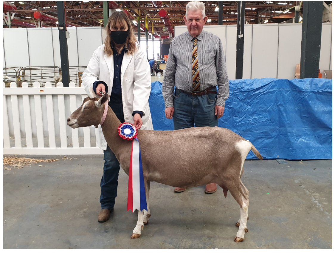
Heidrun Amber Best Exhibit, Champion Toggenburg, Grand Champion Doe and Best Udder Overall