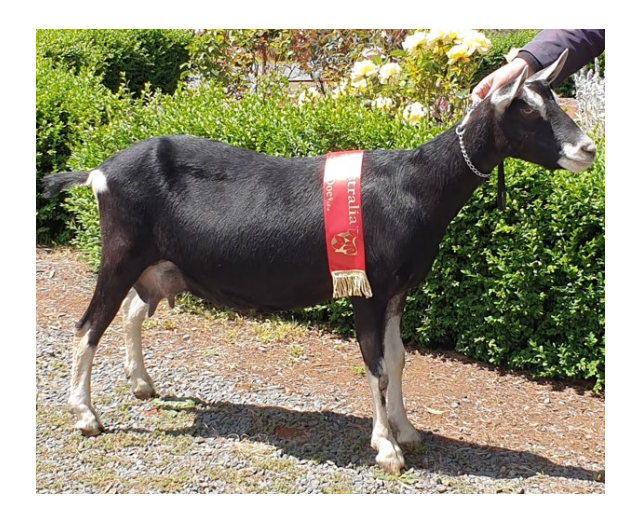
Type and Production (Marel Mhairi)