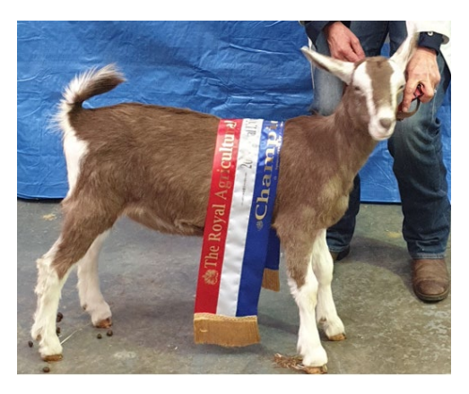
Lavender Park Lavina - Champion Doe Kid