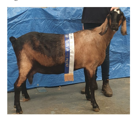
Jiel Kira - Champion Anglo Nubian