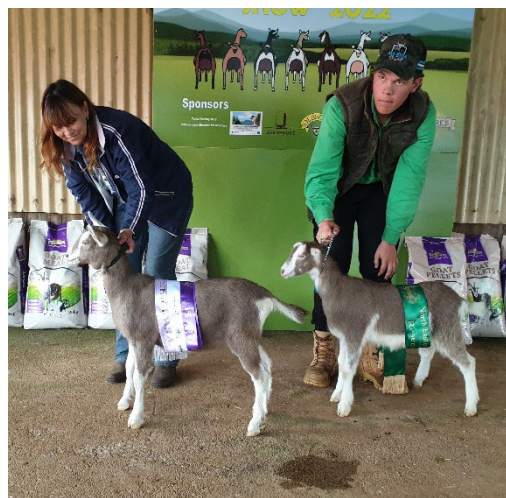
Supreme Champion (top left); Best Udder (top right); Champion Senior Doe and Reserve (middle left); Junior Champion Doe and Reserve (middle right); Champion Doe Kid and Reserve (bottom left) and Champion British Alpine (bottom right)