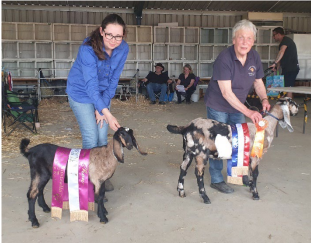
Champion Doe Kid and Reserve