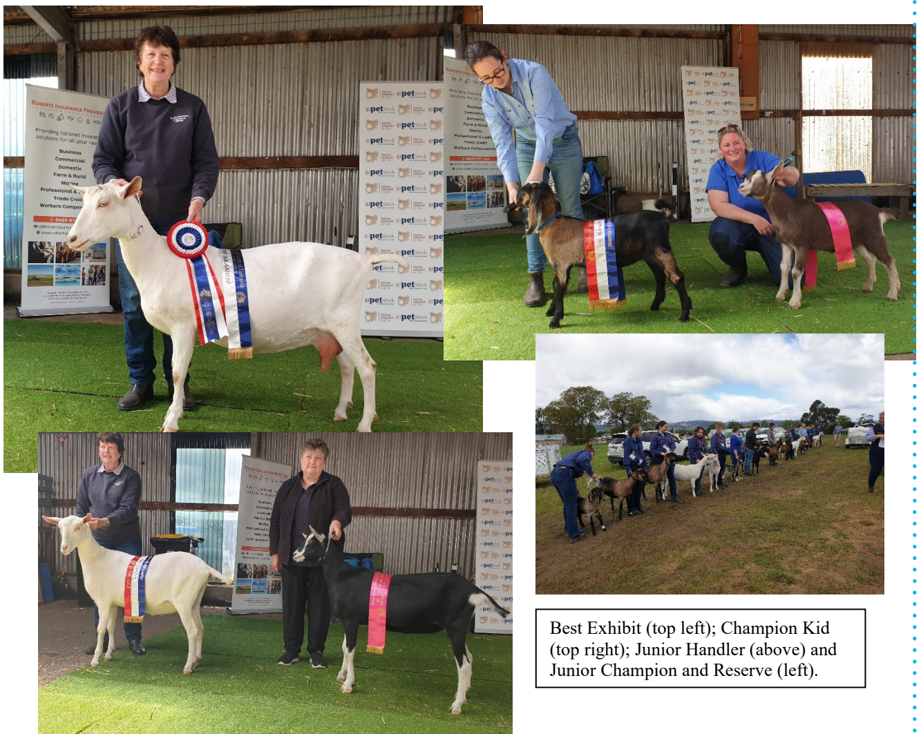
Best Exhibit (top left); Champion Kid (top right); Junior Handler (above) and Junior Champion and Reserve (left).