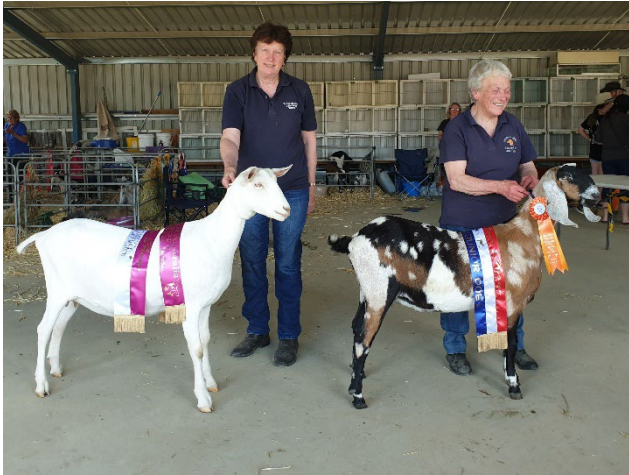
Champion Junior Doe and Reserve