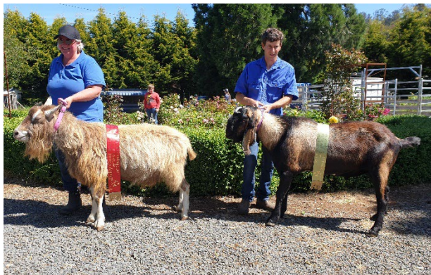
Champion Buck and Reserve