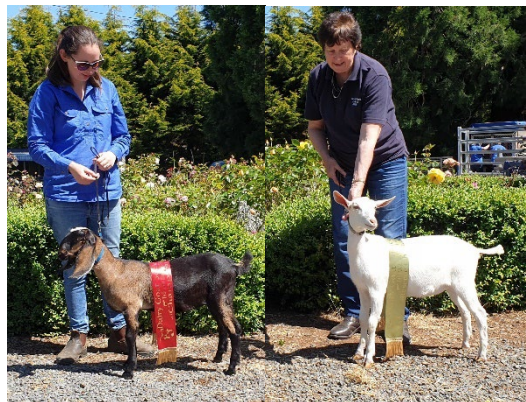
Champion Doe Kid and Reserve