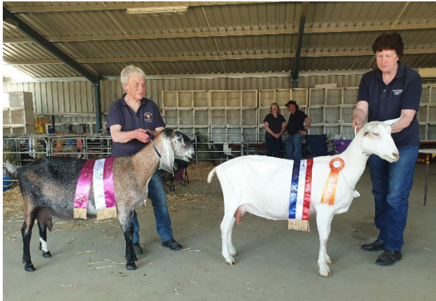
Senior Champion Doe and Reserve