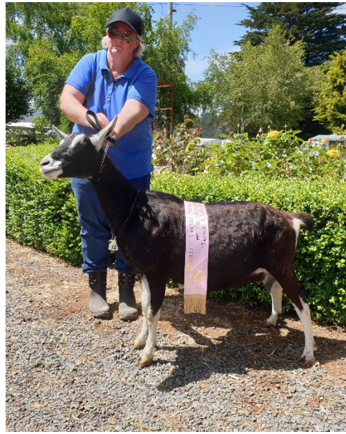
(From top left) Supreme Exhibit, Best Udder (top right), Junior Champion and Reserve (bottom right) and Reserve Senior Doe (bottom left).