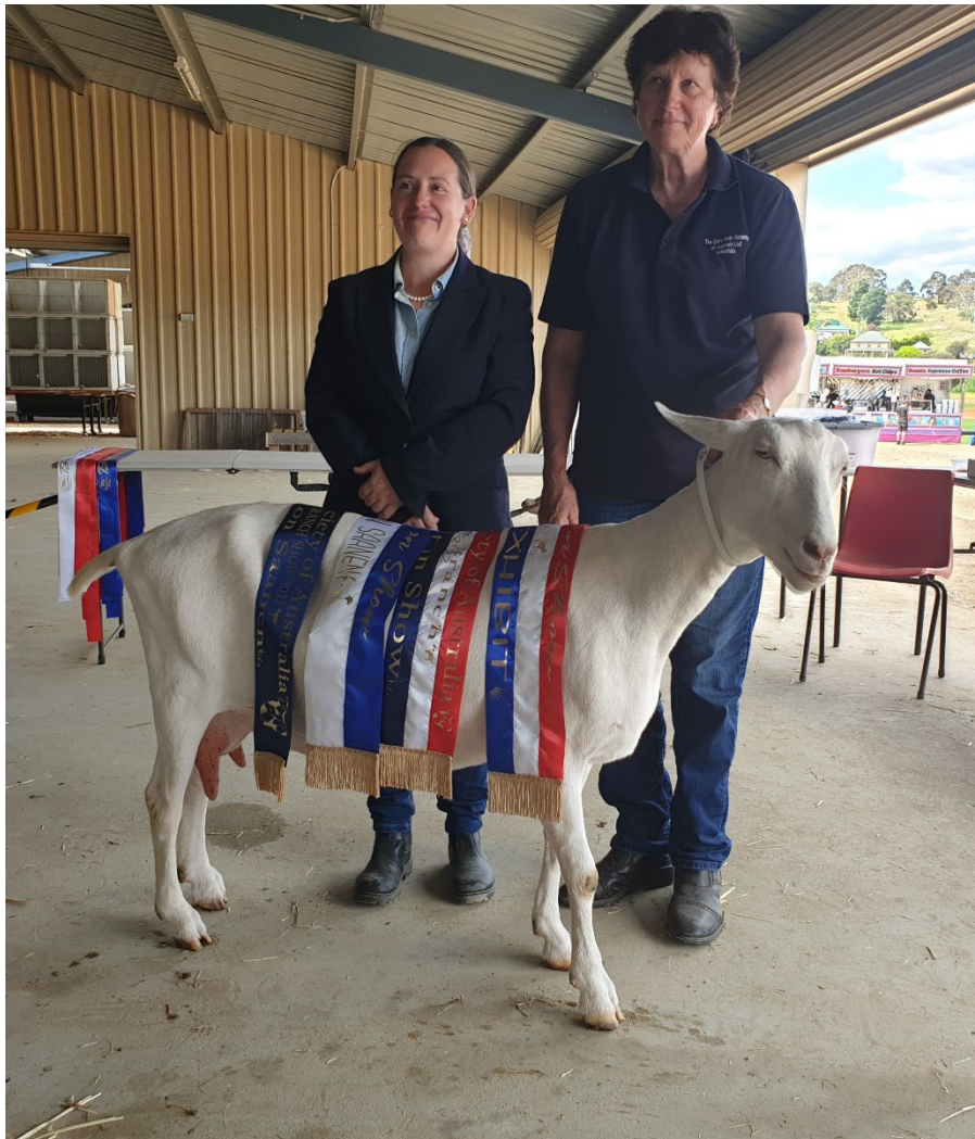
Supreme Exhibit – Highveld Peony-Rose