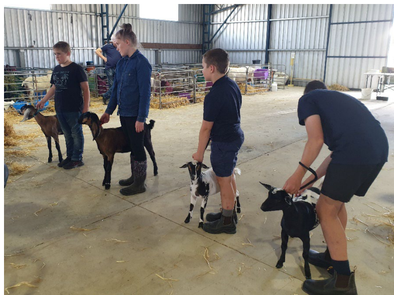
Junior Handler (9 to 12 years)