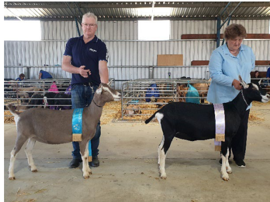
Junior Champion Doe and Reserve