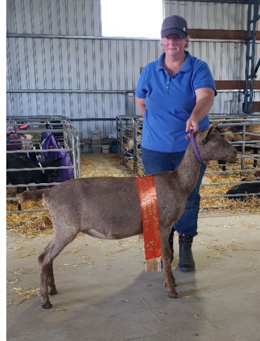
Champion Australian Brown