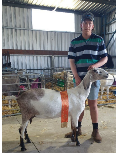
Champion Anglo Nubian