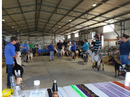
Judging for Senior Champion Doe