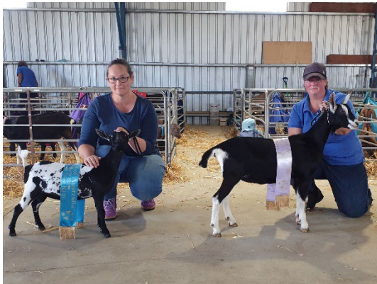
Champion Doe Kid and Reserve