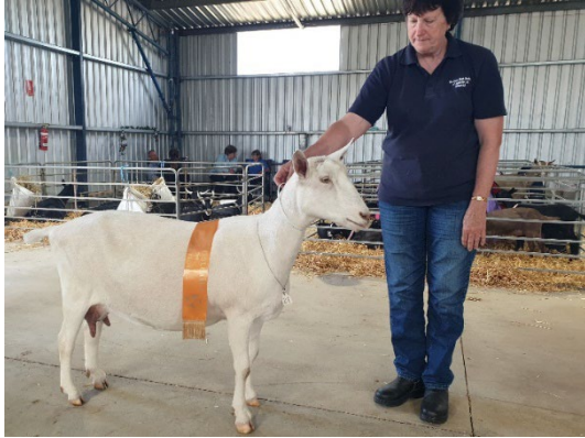
One Day Type & Production