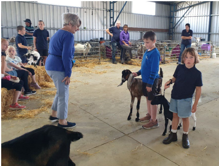
Junior Handler (8 years & under)