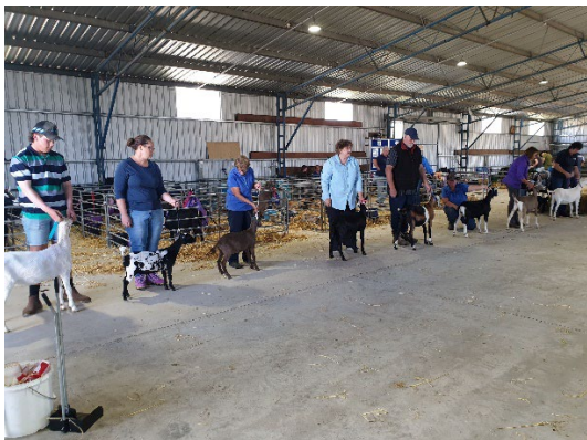
Line up for Champion Doe Kid