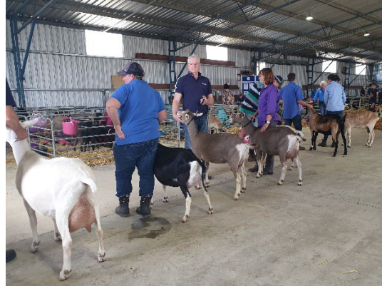
Best Udder 2 nd and Subsequent Lactation Class