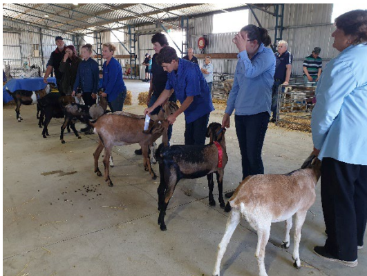
Anglo Nubian Doe Kid Class