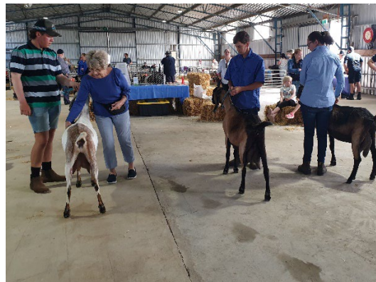
Anglo Nubian Doe in Milk class