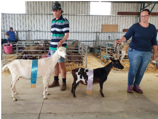
Senior Champion Doe and Reserve