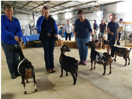
Nigerian Dwarf Doe in Milk class