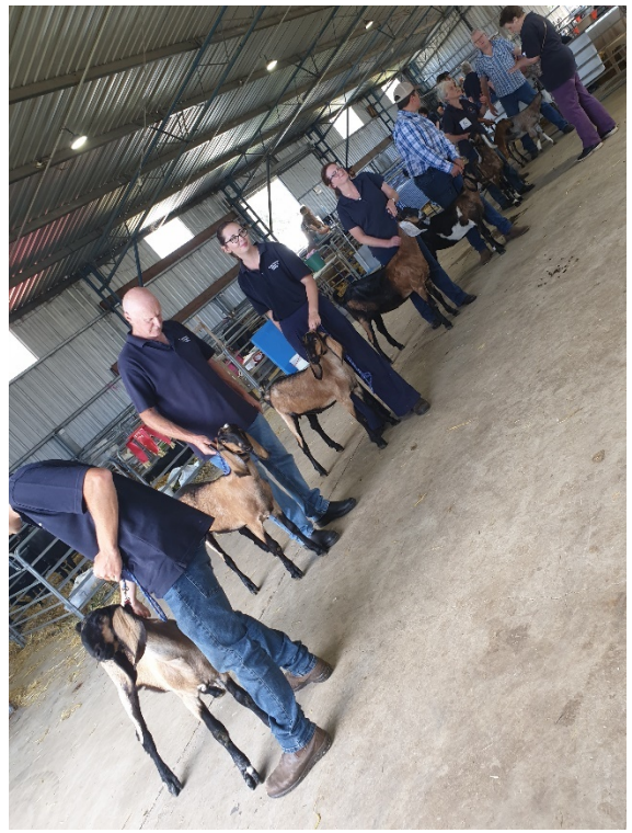
Largest class of the day.