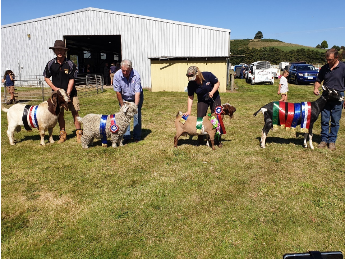
2021 All Breed Champion Line up.