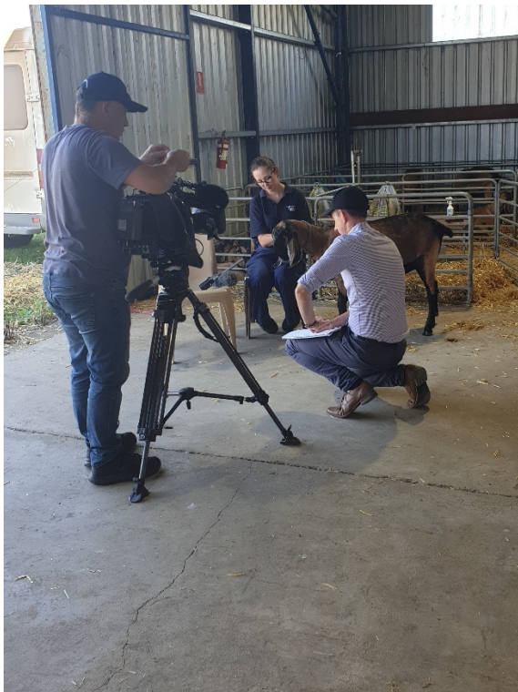
It's hard work being famous!