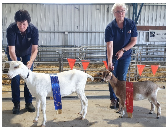
Champion Doe Kid and Reserve