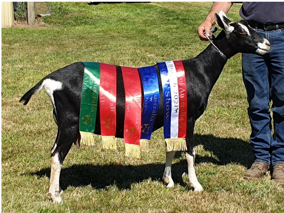
Marel Mhairi – Best Exhibit, Champion Senior Doe, Champion British Alpine, Best Udder Overall and Type and Production winner.

HIGHVELD PEONY-ROSE HEIDRUN AMBER MAREL MHAIRI KILLARA RAM BARROMIA MAREL MIA PETIT PARADIS AMIRA