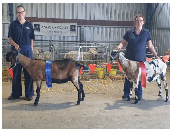
Champion Junior Doe and Reserve