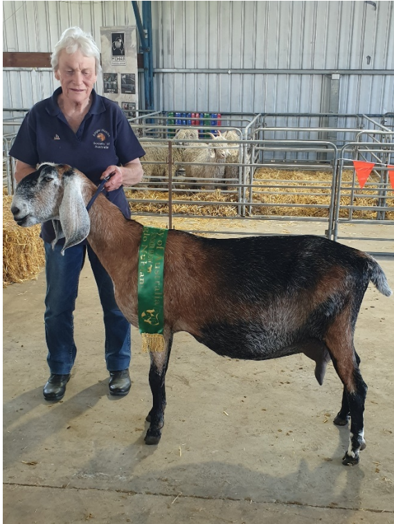
Champion Anglo Nubian and Reserve Senior Champion