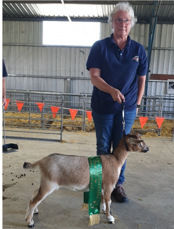
Champion Nigerian Dwarf and Reserve Champion Doe Kid