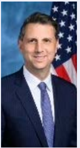
SETH MAGAZINER Economics of Aging Panel Presenter