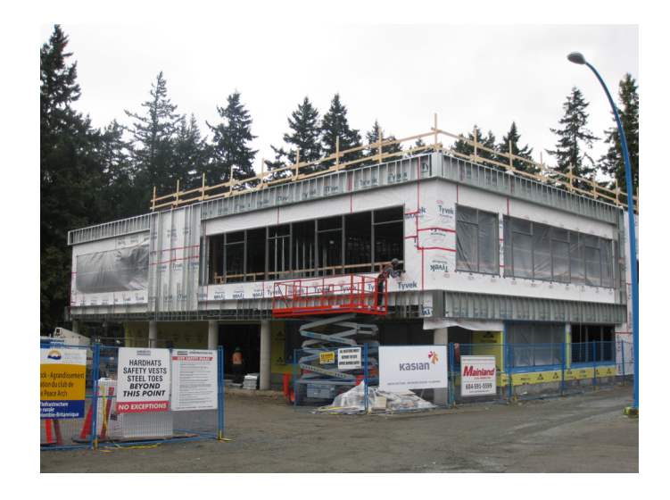
2011 – Centre for Active Living houses PACC