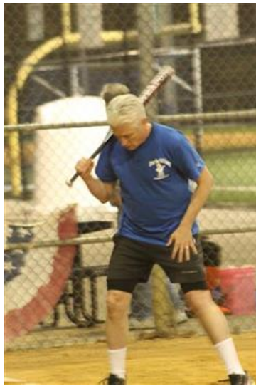
Let's see, feet 25in apart, check!