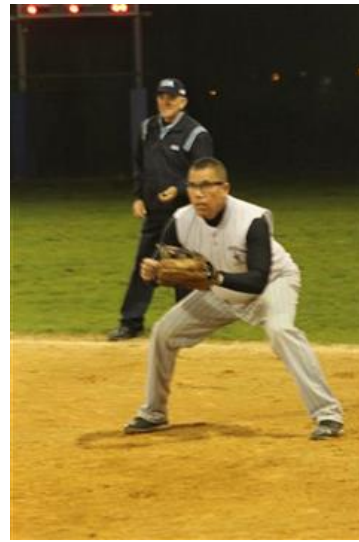
Ready for anything hit my way...