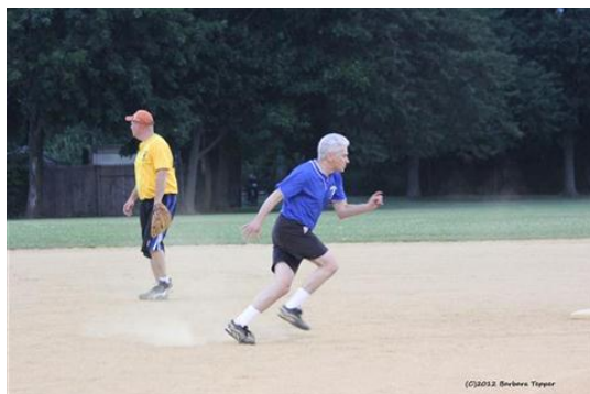
Uh Oh, back to second...