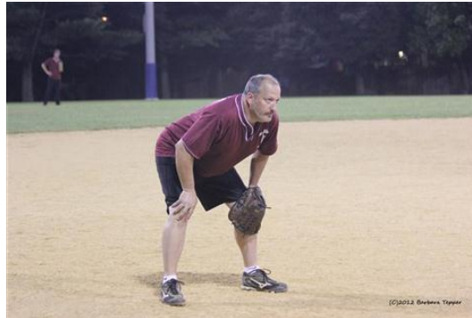
Deep concentration is what it takes...