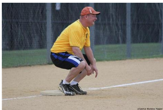
Ready to spring into action...