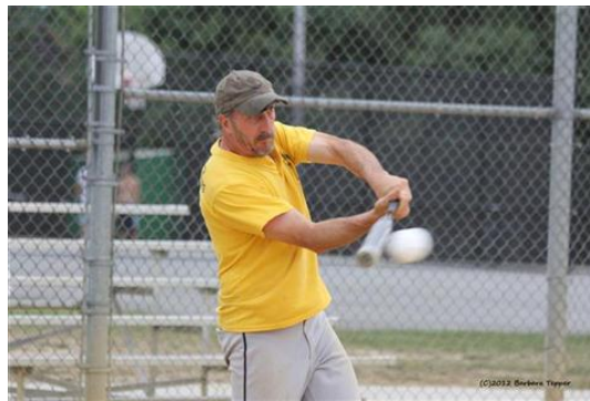
Bat meets ball for a hit...