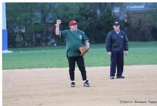
How many outs are there...