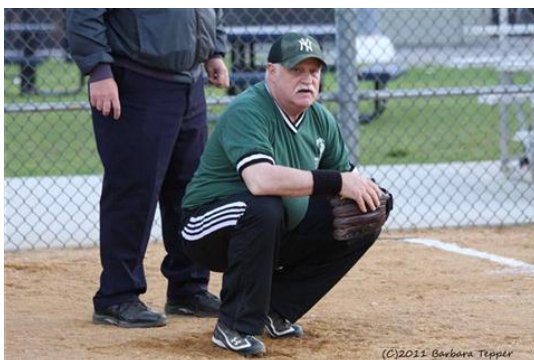
A catcher's work is never done...