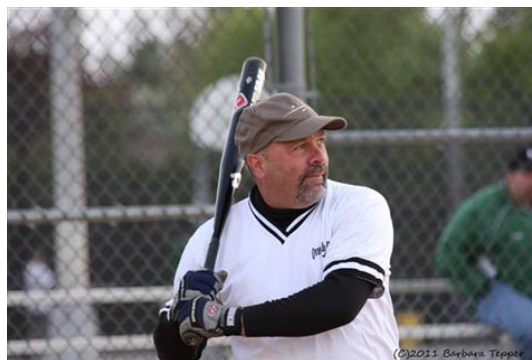
Determined to get a hit...