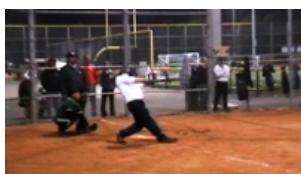
M&T going for the fences...