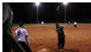
Mers going for the fences

In Round 3 of the Tournament, Everyone had the same thing in mind - Score Runs