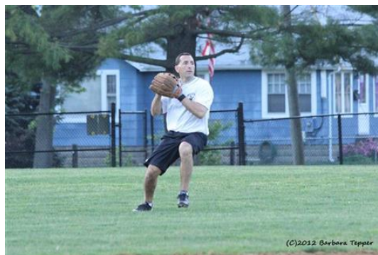
Set and throw - simple...