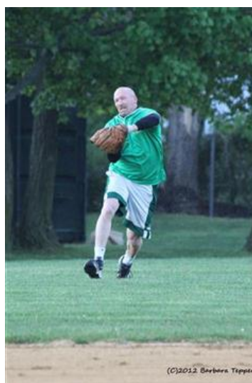
On the run and throw #2...