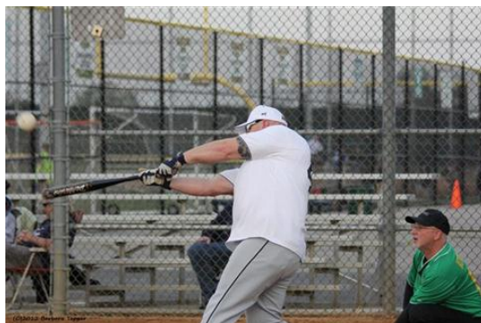
This may be "outta here"...