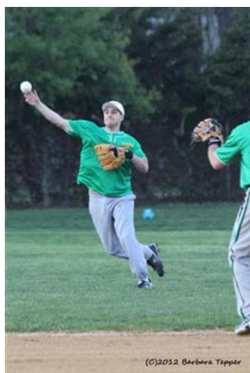
On the run and throw #1.