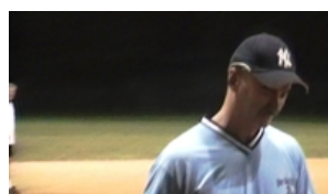
Bino from Zwanger Pesiri