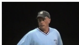
Zwanger Pesiri Player