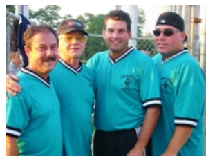
J Two Lounge