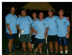
Zwanger Pesiri Team