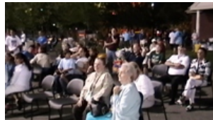
Our whole community lending its support