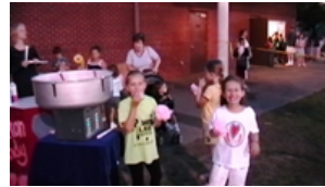
Cotton Candy keeps them happy...