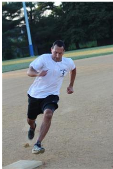
Rounding Third --->