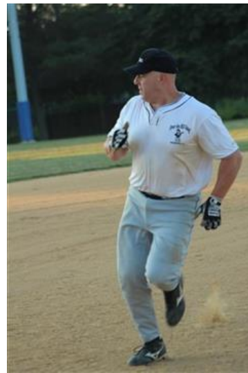
Rounding Third --->