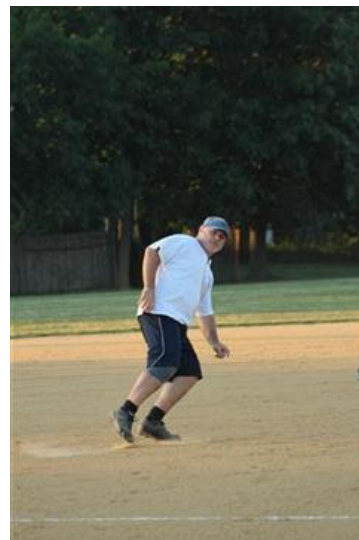
Whoops, maybe NOT Rounding Third...