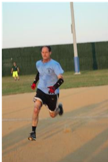
Rounding Third --->