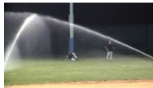
Granny O'Shea's hoped for rain but all they got was a sprinkler delay