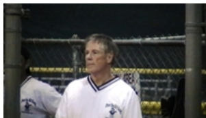
M&T on deck considering where to go with the pitch...