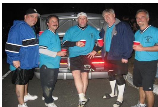
J Two victorious...