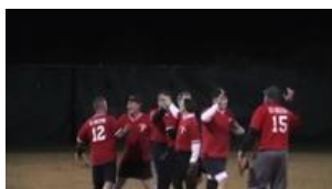
Singletons wins it...