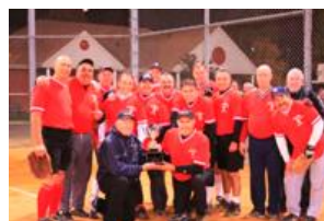
Winning team for 2008...