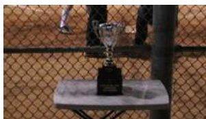
The Cup waits for the new champ...