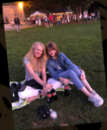
Local Food & Wine