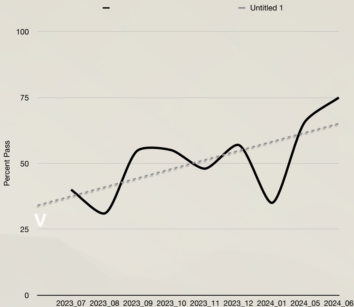
Pass Rate, by month