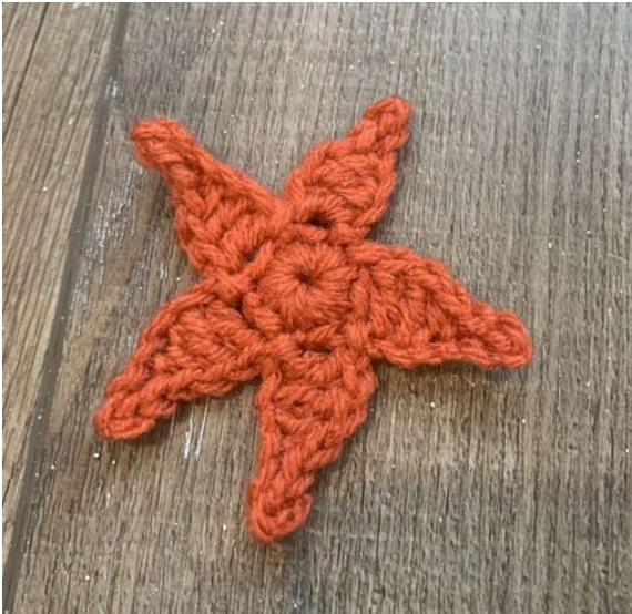
Starfish is ready!