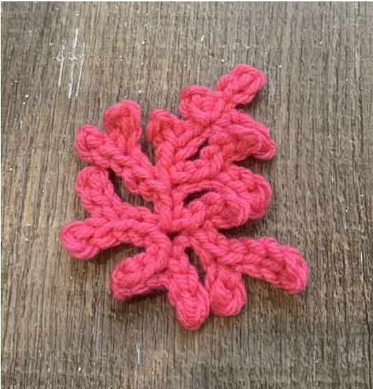
Corall is ready!