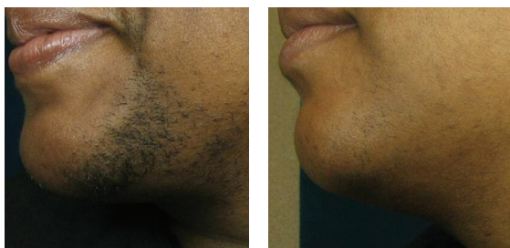
Hair removal before and after 2 treatments