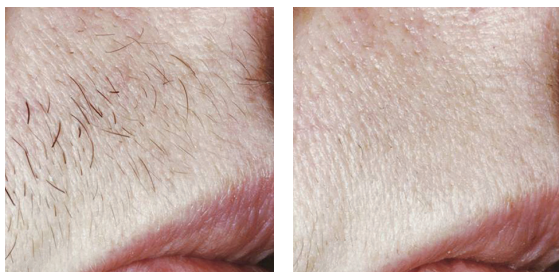
Hair removal before and after 3 treatments