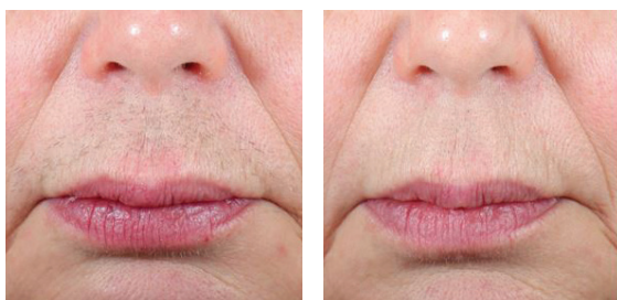
Hair removal before and after 2 treatments

Ask us if Elite iQ™ treatments are right for you.