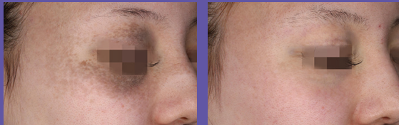
Before & After 3 Treatments