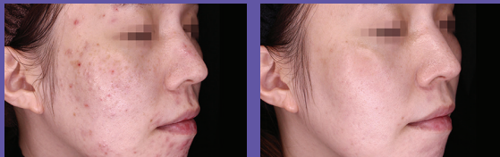
Before & After 3 Treatments

Learn more about/ Cynosure's PicoSure Pro treatments at cynosure.com