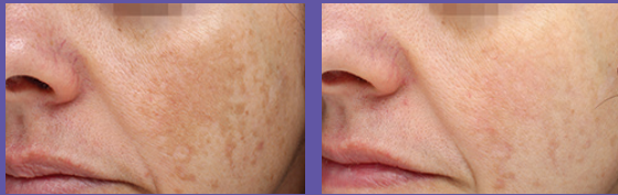
Before & After 3 Treatments

An award-winning device with award-winning results/