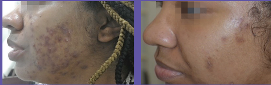
Before & After 1 Treatment