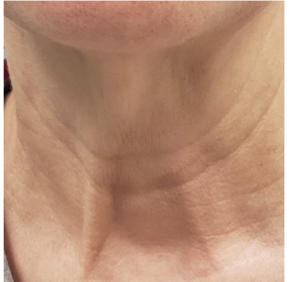
Before & 6 weeks after 2 treatments