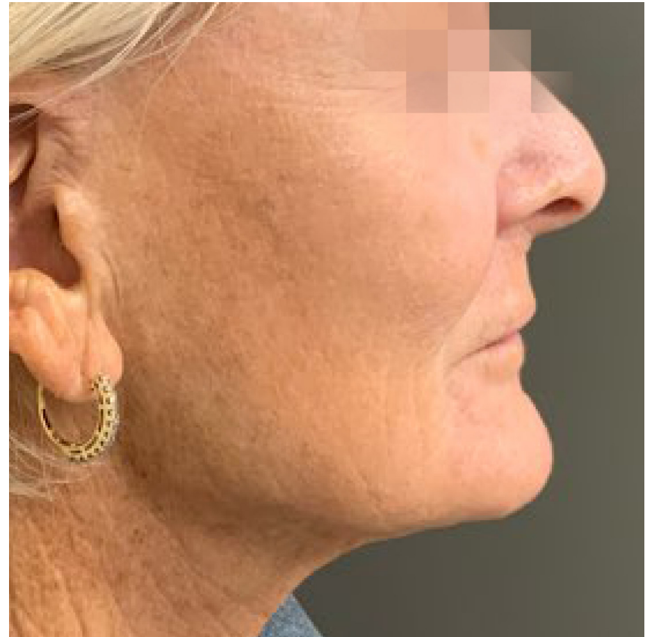
Before & after 3 treatments