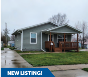
NEW LISTING! 514 W Montgomery St., Knoxville $215,000 | 4 BD / 2 BA