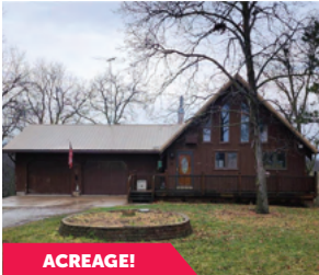
ACREAGE! 1134 Illinois Dr., Knoxville $385,000 | 3 BD / 3 BA