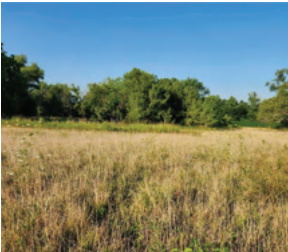
2454 Picard Dr, Knoxville $20,000 | No Covenants!