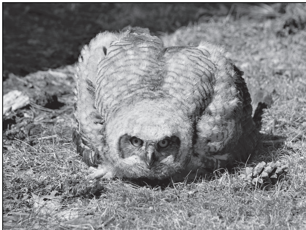
Young Great-horned owls are growing up.