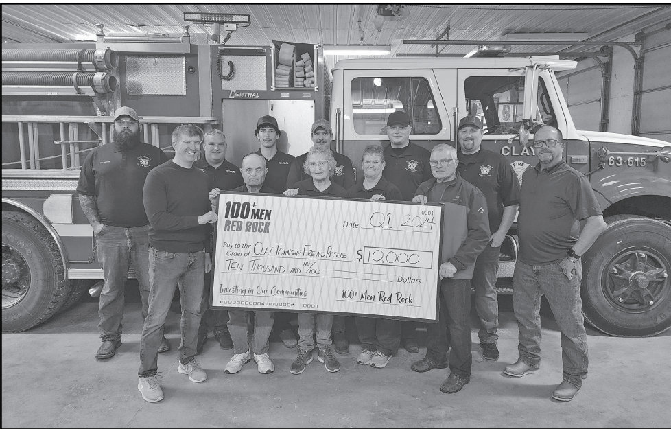
Pictured: Members of 100+ Men Red Rock Leadership Team present a check for $10,000 to Clay Township Fire and Rescue.