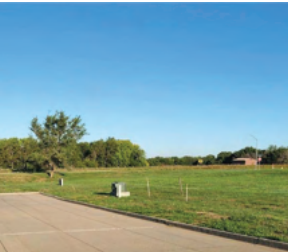
Units 1,15,16,17 McKay Dr., Knoxville $27,500 ea. | Condo Lots