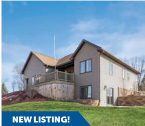
NEW LISTING! 1427 Westview Dr., Knoxville $375,000 | 3 BD / 3 BA