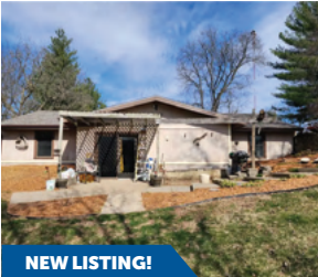
NEW LISTING! 1212 Highway 14, Knoxville $325,000 | 2 BD / 2 BA