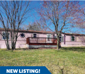
NEW LISTING! 6048 139th Trail, Lovilia $80,000 | 3 BD / 2 BA