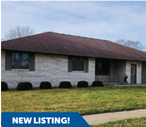
NEW LISTING! 1700 W Larson St., Knoxville $339,500 | 3 BD / 3 BA