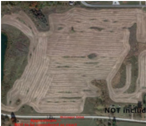
118th Place & McGregor Dr, Knoxville $477,000 | Ag Land