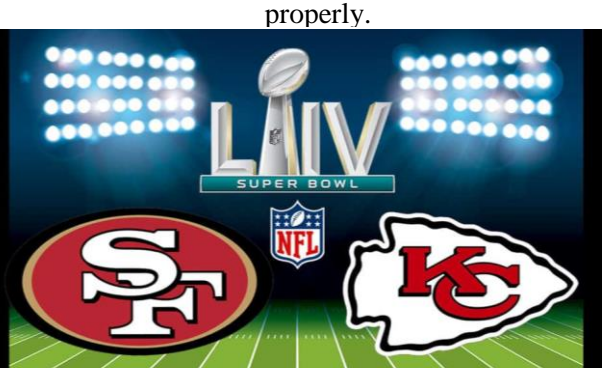
When is Super Bowl LIV?Super Bowl LIV will be played on Sunday, Feb.2, 2020. Kickoff is set for 6:30 p.m. ET.

Anyone caught illegally dumping items that do not belong in the appliance area will be charged $250 dumping fee. Please ensure all garbage bags and trash thrown in the compactor. Local animals can make a mess when there are torn bags; Please assist by making sure the trash is dumped