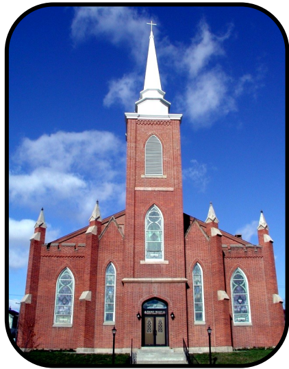
St. Mary 312 Clark St. Hollidaysburg, PA 16648

Mass Schedule at St. Mary: Saturday Vigil: 4:00 PM Sunday: 7:30 and 10:00 AM. Daily and Holy Days: See inside