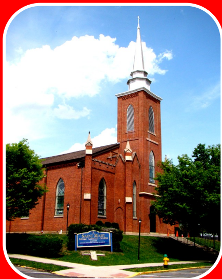
St. Mary Parish 312 Clark Street Hollidaysburg, PA 16648

Parish Email: stmmaryhburg@dioceseaj.org