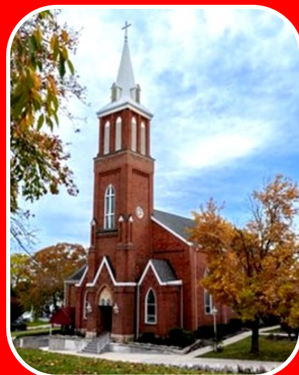
St. Michael the Archangel Parish 301 Spruce Street Hollidaysburg, PA 16648

Confessions: Saturday: 1:00 PM - St. Michael Wednesday: 5:30 PM - St. Mary Thursday before the First Friday of the month: 4:00 PM - St. Mary