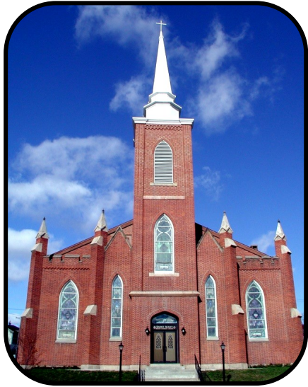
St. Mary Church 312 Clark Street Hollidaysburg, PA 16648