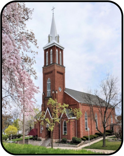
St. Michael the Archangel Church 301 Spruce Street Hollidaysburg, PA 16648

Call the church office to schedule an appointment. A notice of 9 months is required for marriage and a notice of at least 1 month is required for Baptism.