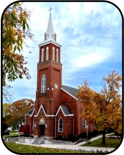
St. Michael the Archangel Parish 301 Spruce Street Hollidaysburg, PA 16648

Confessions: Saturday: 1:00 PM - St. Michael Wednesday: 5:30 PM - St. Mary Thursday before the First Friday of the month: 4:00 PM - St. Mary