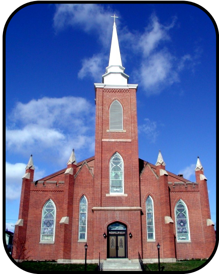
St. Mary Parish 312 Clark Street Hollidaysburg, PA 16648