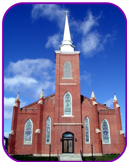
St. Mary 312 Clark St. Hollidaysburg, PA 16648

Mass Schedule at St. Mary: Saturday Vigil: 4:00 PM Sunday: 7:30 and 10:00 AM. Daily and Holy Days: See inside