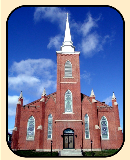
St. Mary 312 Clark St. Hollidaysburg, PA 16648