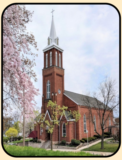
St. Michael The Archangel Parish 301 Spruce St. Hollidaysburg, PA 16648