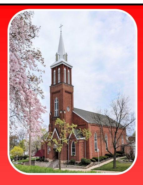
St. Michael the Archangel Parish 301 Spruce St. Hollidaysburg, PA 16648