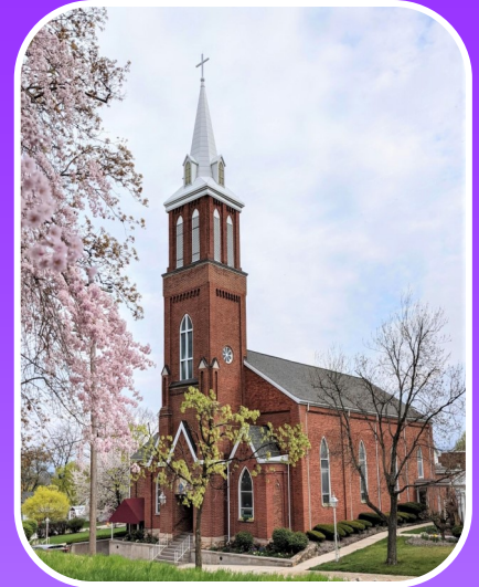
St. Michael The Archangel Parish 301 Spruce St. Hollidaysburg, PA 16648