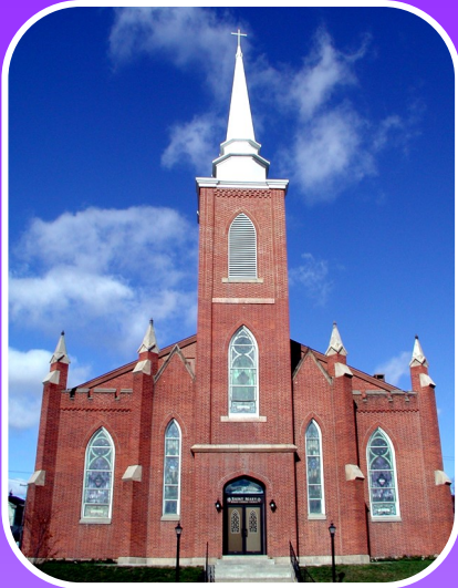
St. Mary 312 Clark St. Hollidaysburg, PA 16648