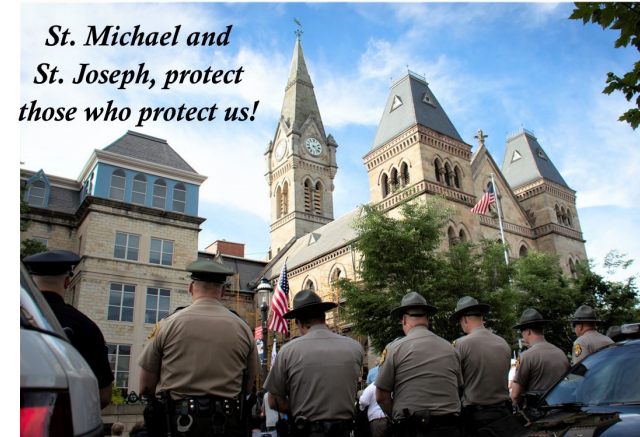
Please bring your own chairs.

St. Michael and St. Joseph, protect those who protect us!